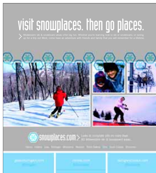
MSAA Ski Press Magazine ad that launched their Midwest coverage